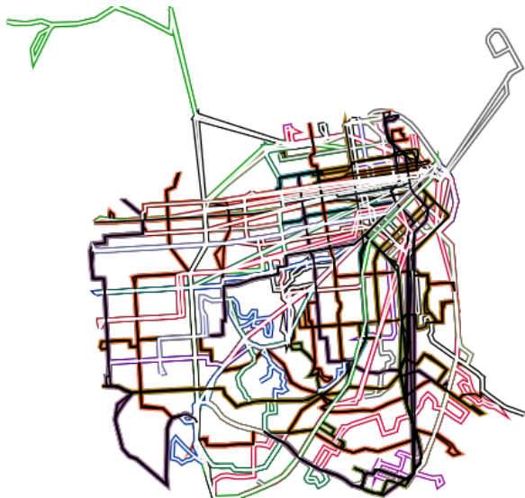
Figure : All Routes